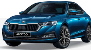
Full Size Sedan