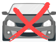
50 Gasoline Rental Cars

ExpatRide can lower the client's CO2 emissions by between 30% (hybrid) and 80% (electric) with eco-friendlier options.