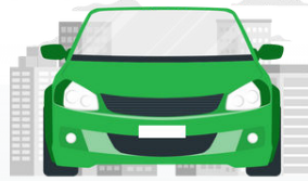
50 Hybrid Rental Cars