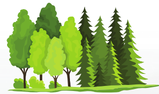
6,700 Trees Saved per Year

The EcoRide Impact - It's easy to make a difference! Switching 50 assignees from gasoline to hybrid rental cars on an annual basis can make a significant environmental impact.